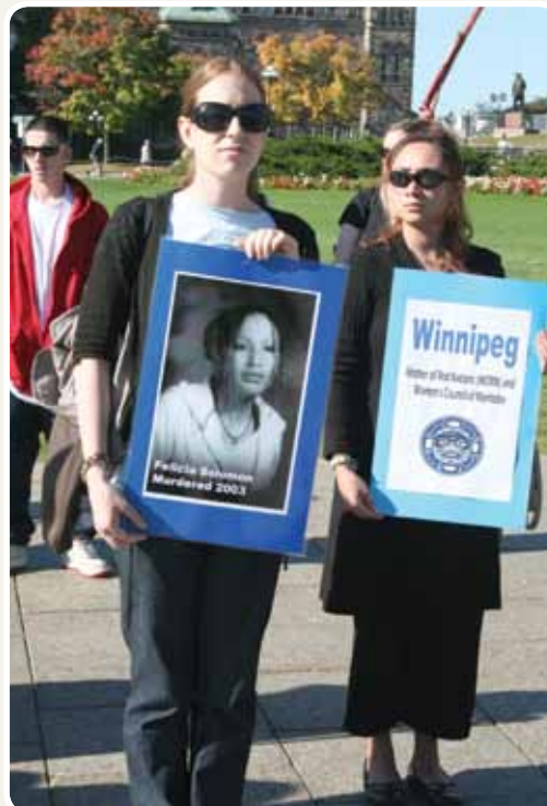
Woman holds a placard of a murdered Aboriginal woman.

Most of the cases in the database are from the last 10 years, but there are likely older cases. The oldest case in NWAC's database occurred in 1944, but most are much more recent; 39% of the cases in NWAC's database occurred between 2000 and 2010, and 17% occurred in the 1990s. In contrast, only 2% of the cases in the database occurred before 1970. This gap strongly suggests that there are still many older cases to document.