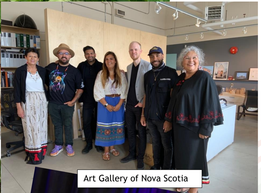
Art Gallery of Nova Scotia