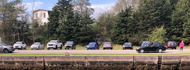
On Treaty Day