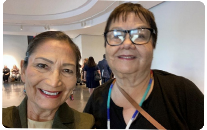
U.S Secretary of Interior Deb Haaland, NWAC President