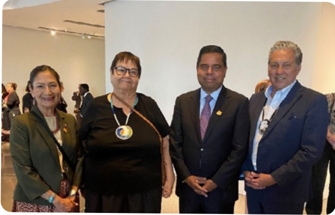
U.S Secretary of Interior Deb Haaland, NWAC President, The Honourable Gary Anandasangaree (Minister of Crown-Indigenous Relations) & The Honourable Dan Vandal (Minister of Northern Affairs)