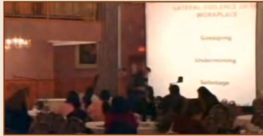
A YouTube clip of Rod Jefferies' workshop on lateral violence in Winnipeg.

www.bearpawmedia.ca/content.php?ID=15&prodid=72