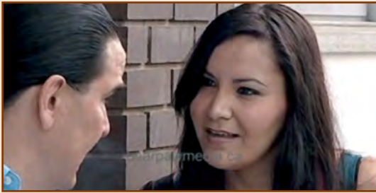
Bearpaw Media Productions -- Lateral Violence Video

This is a documentary-drama that takes a look at lateral violence in our own Nations, communities, organizations and families. Hosted by Tantoo Cardinal, this Lateral Violence video sheds a new light on an age old topic – ourselves.