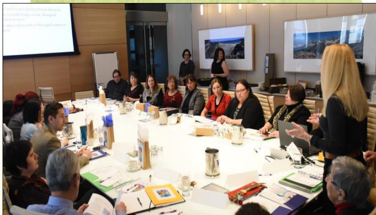
Participants at the March 6 th Bridging the Gap: Aboriginal Women and the Resource Development Sector Discussion Forum.

In our BORDS research study, Aboriginal women survey participants identified the following as top barriers to employment in the resource development sector: